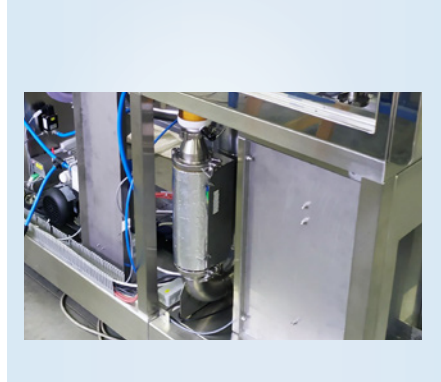
Integrated VHP Generator