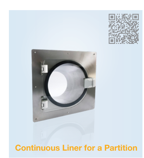
Stainless Steel Furnishings