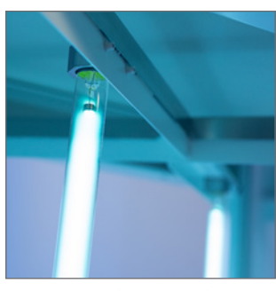
UV-C sterilization lamp OSRAM