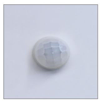
Safety motion sensor