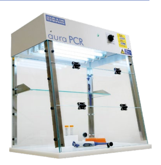
(+) Working area walls in tempered glass 6 mm thick