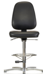
Special chairs for GMP and cleanrooms