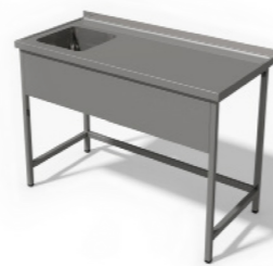
Sink welded into