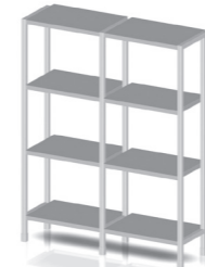
Stainless steel rack